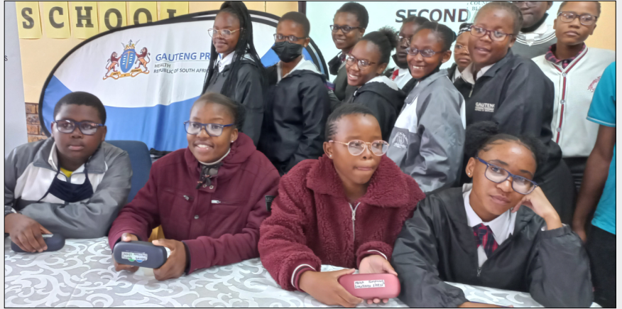
A few of the happy recipients of new spectacles supplied by Lions BrightSight.