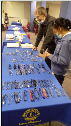
Choosing my frame!

The goal of the project was pleasantly exceeded: